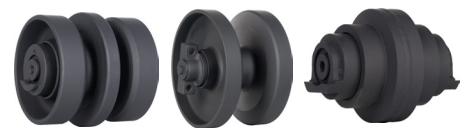
TOP & BOTTOM ROLLERS

Midwest Equipment 777 Manor Park Dr., Columbus, OH 43228