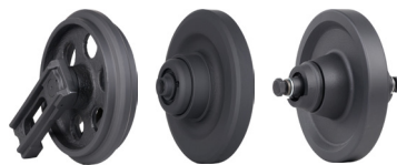
FRONT & REAR IDLERS